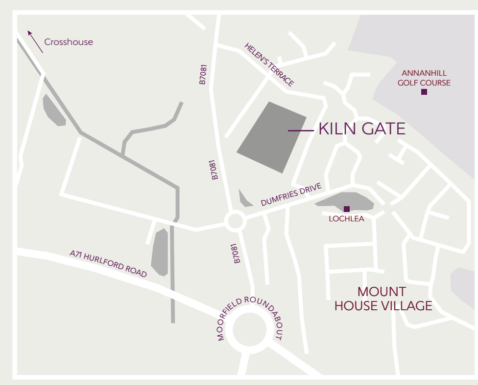
Map not to scale.