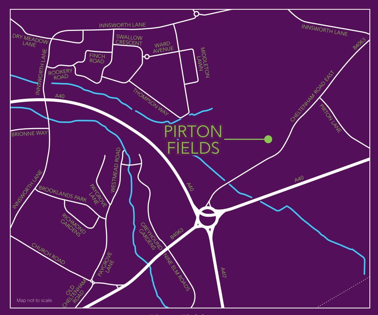
Pirton Fields, Cheltenham Road East, Gloucester GL3 1AF