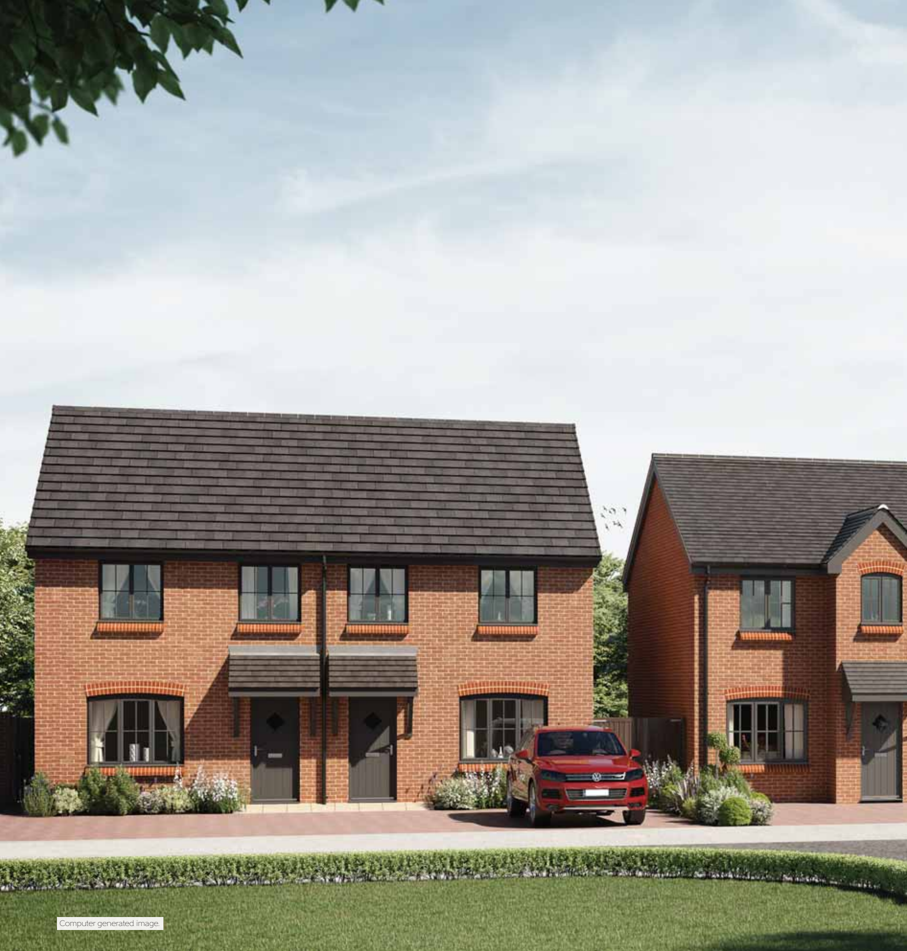
Computer generated image.